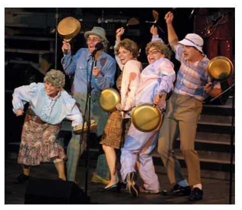
The Pancake Flippers of Blue Lake in a scene from Wild Card

The Dentalium Project holds lessons about the capacity of a resident theatre to provoke community dialogue and create a space for the safe exploration of conflict. The case study examines issues of representation in the struggles of a majority white theatre company making art about issues involving Native Americans, and