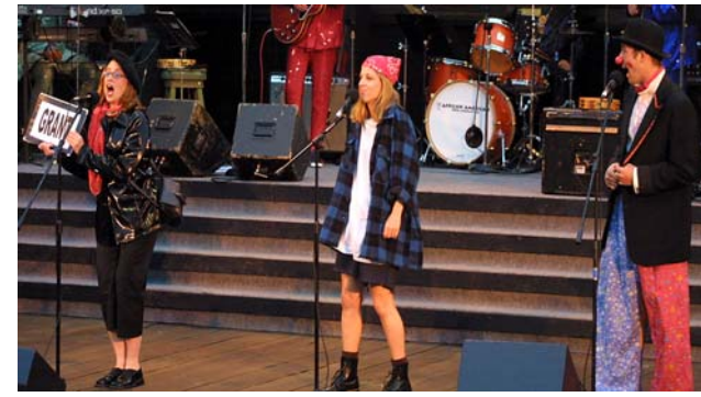
The No Lake Players announce "We Got a Grant!"

Wild Card is set in the future, during the celebration of the casino's Tenth Anniversary in 2012. The local Chamber of Commerce has invited local-boy-made-good, Buddy O'Hanlan, to be