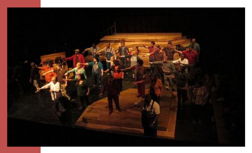
Higher Ground Performance at MicroFest.

Like many of the arts collaborations MicroFest visited, the Higher Ground project has used its particular creative forms—story gathering, play creation, and performance—to enact what Imagining America's <u>Curriculum Project Report</u> defines as <u>community cultural development</u>: "self-directed development strategies, where members of a community define their own aims and determine their own paths to reach them, rather than imposed development, which tends to view communities as problems to be solved by bringing circumstances in line with predetermined norms." The latest Higher Ground play will be staged in unoccupied buildings throughout the county as part of a process to design new community spaces, bringing residents together to imagine a new future for real estate that has been inaccessible for public uses. One such facility is the old high school in Evarts, Kentucky, with a population of approximately 1,000.