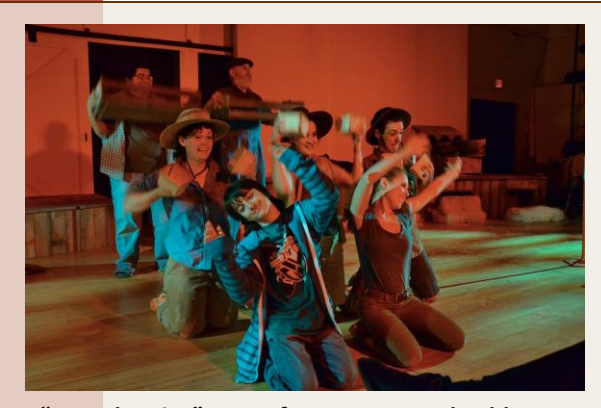
"Strawberries" scene from Farms and Fables

<u>Grow Appalachia</u>, a community agriculture program that works across a number of counties in the Central Appalachian region, is designed with an awareness of economic justice and social justice issues that impact its participants. But according