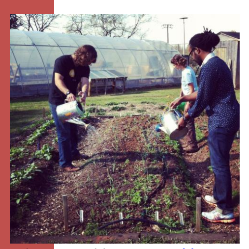
MicroFest participants at Beardsley Community Farm, Knoxville

The collaboration between Carpetbag Theatre and the FISH Hospitality Pantry has culminated in the development and performance of a musical play, The Hungry Heart , created by the pantry and based on the stories of its volunteers and patrons. The cast, some playing characters based, in part, on their own experiences, performed several scenes in the gym of the former Beardsley Junior High School.