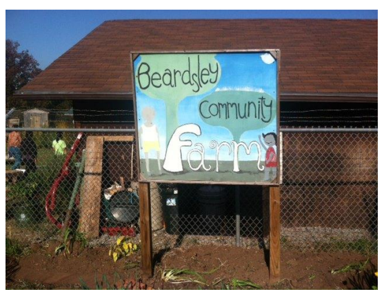
<u>Beardsley Community Farm</u>, Knoxville, site of MicroFest's Art & Food Justice session.

In addition to developing and producing its own new plays, Carpetbag Theatre works in partnership with other artists and non-arts organizations to support projects through a residency process designed to honor and elevate community voices and knowledge. One such partner is the FISH Hospitality Pantry, a food pantry located in Mechanicsville, a working class neighborhood on the north side of Knoxville. Homelessness has been a chronic issue in Knoxville, and the influx