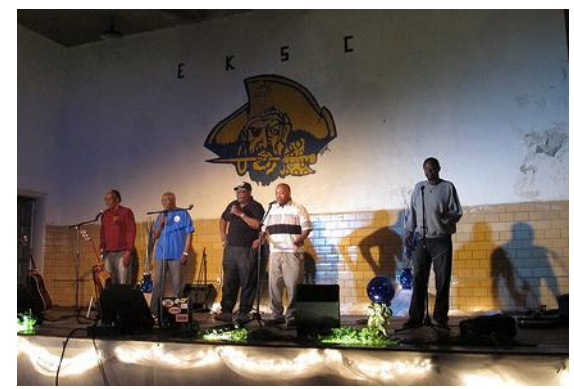
The Mt. Sinai Spirituals perform at the Eastern Kentucky Social Club.

Social Club is based in a former school building, where MicroFest participants enjoyed barbeque and joined the