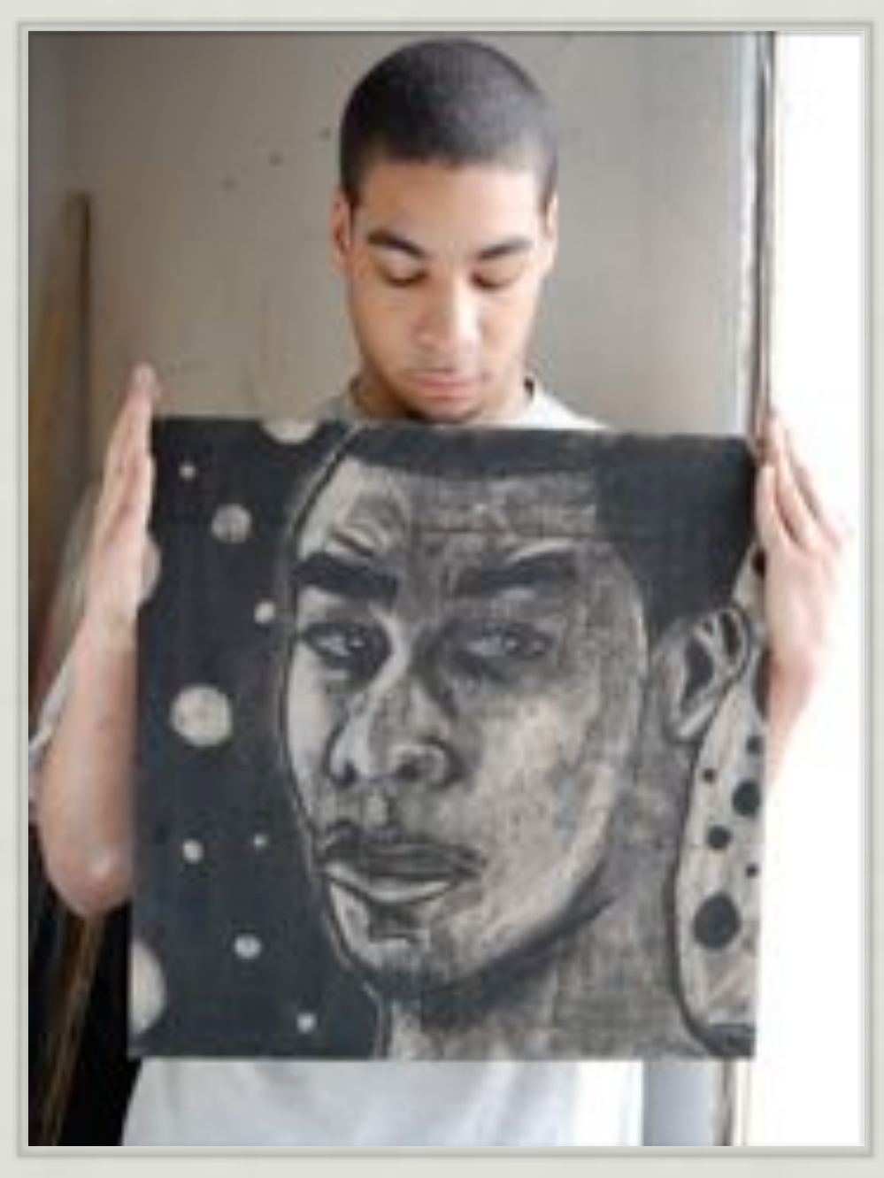
TEEN FROM RAW ART WORKS WITH SELF-PORTRAIT

Youth develop confidence, knowledge of self, an informed cultural identity, and a positive view of their future.