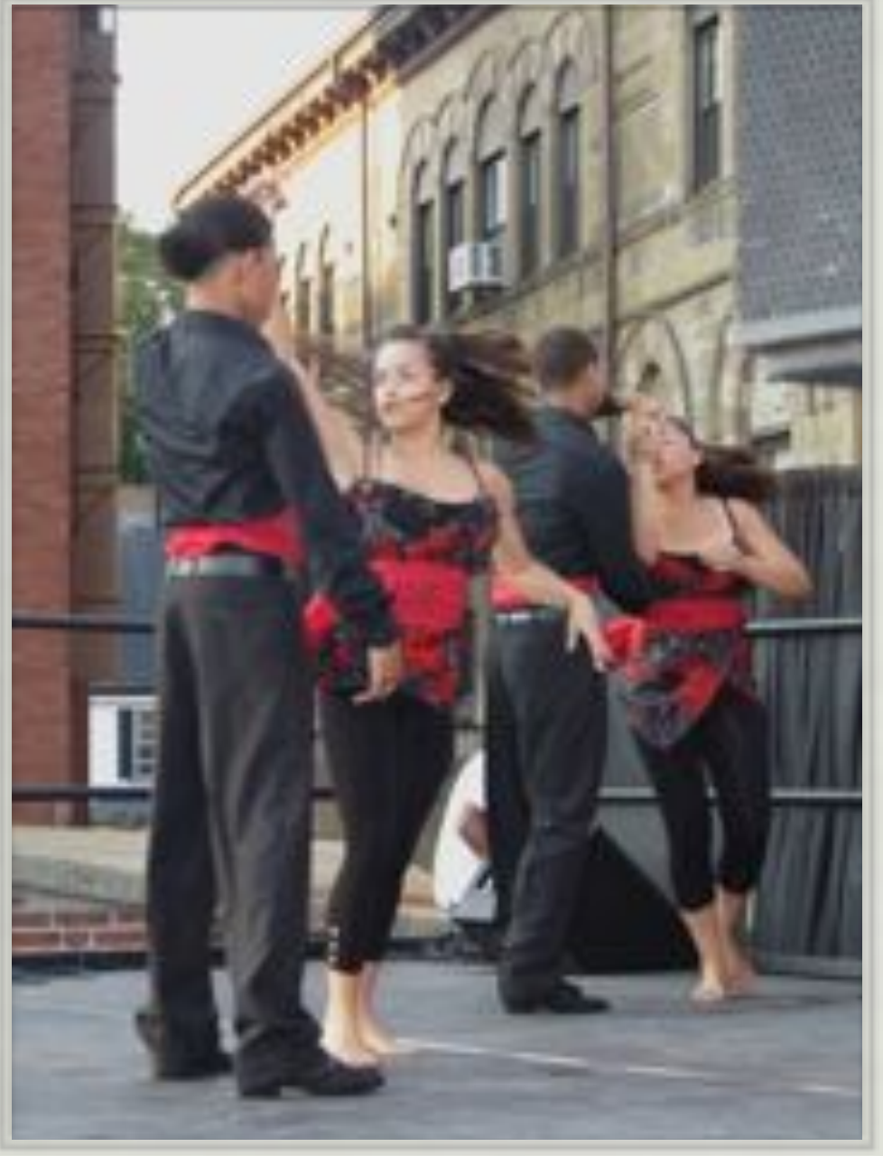
TEENS FROM HYDE SQUARE TASK FORCE: Ritmo en Accion dancers show their passion for dance with a Tango performance.

• Youth become proficient, expressive, competent musicians and well-rounded artists.